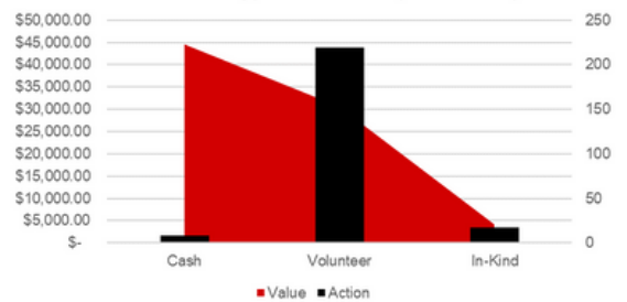
Mobilization Type and Value (2021-2022)